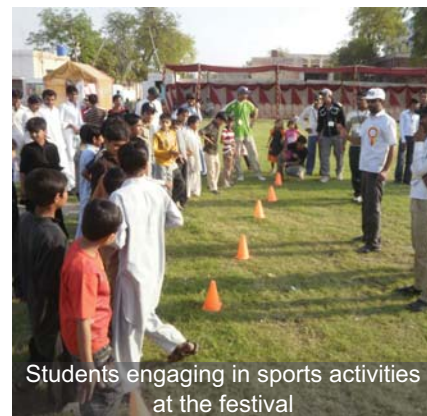
Students engaging in sports activities at the festival

The Sports Youth Council of Government College Hyderabad participated in organizing a Jashan-e-Baharan Festival on March 23, 2011 to mark Pakistan Day. Several activities were featured at the event including a singing competition, musical program and food stalls. Additionally, various sports activities were conducted including hurdle and flat races. Students and their families visited the festival, taking the total visitor count to over 500 people.