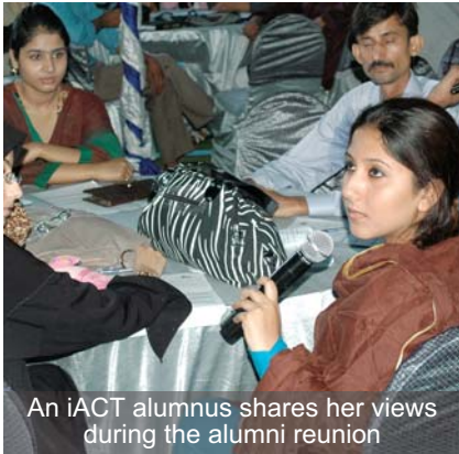
An iACT alumna shares her views during the alumni reunion

iACT aims to provide a platform to its alumni to stay connected and share their experiences. iACT alumni met at its first reunion in April 2011, during which the framework for the iACT Alumni Association was shared with them.