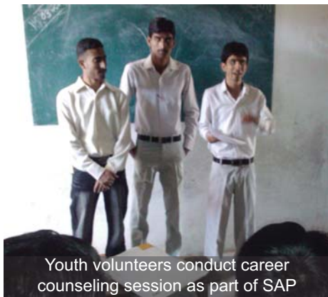
Youth volunteers conduct career counseling session as part of SAP

This Social Action Project (SAP) aims at sharing career information with students of grades IX and X. Through this SAP, students are given career guidance and they learn about the qualifications, knowledge and skills required to pursue certain careers. Six schools with lower socio-economic status have been identified. The SAP team visited four schools and conducted interactive sessions with the students.