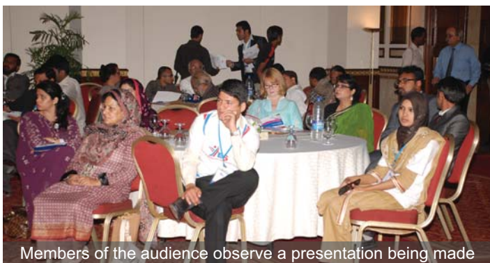
Members of the audience observe a presentation being made