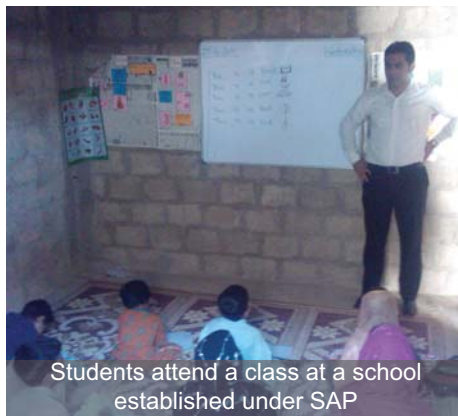
Students attend a class at a school established under SAP

This SAP aims at helping females and children belonging to lower socioeconomic communities to acquire basic literacy skills. A home based school has been established with the support of SAP grant and local resources in Bhitayyabad (an underprivileged area of Karachi). The school is imparting basic Urdu and Mathematics skills to interested women and children.