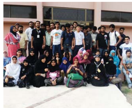
A shot of iACT students and iLEAD faculty members at the Sports Day

A daylong sports activity was held at the Institute for Advancing Careers and Talents (iACT) in April 2011. 90 students engaged in badminton and table tennis matches and other sports competitions organized by the iLEAD faculty. The Sports Youth Council helped in organizing the event. iACT faculty and support staff also participated in staff matches.