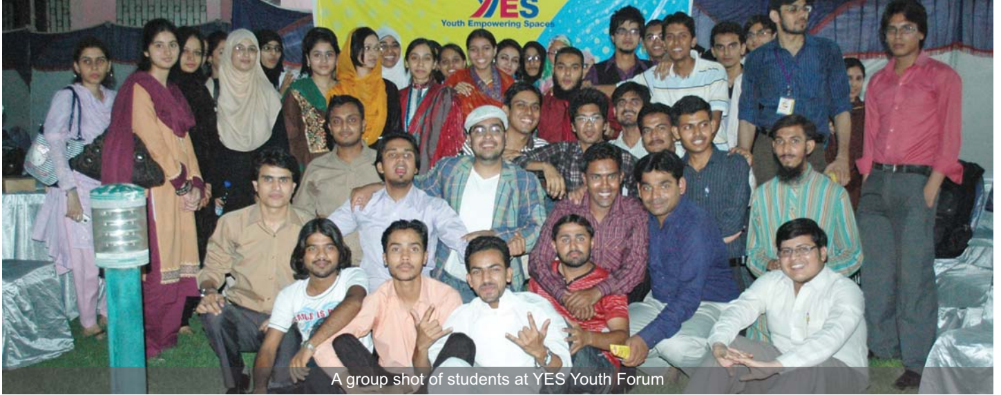
A group shot of students at YES Youth Forum

Youth Empowering Spaces (YES) is providing opportunities to youth for self-development, an integral aspect of which is self-expression. As a part of the YES mandate, the first Youth Forum was organized in April 2011. 150 young participants attended the event. A presentation was made about YES. The activities of YES revolve around four themes, namely Personal Development and Empowerment; Career, Academic and Health Information and Guidance; Technology for Empowerment and Raising Awareness and Consciousness.