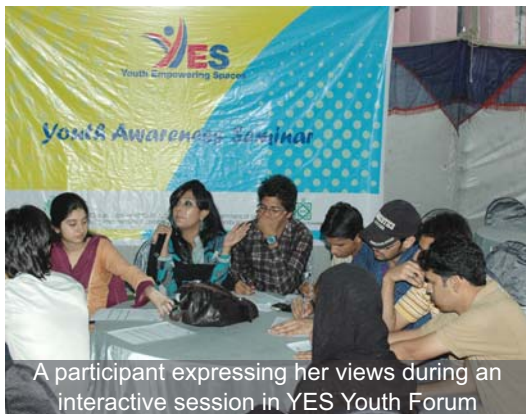
A participant expressing her views during an interactive session in YES Youth Forum