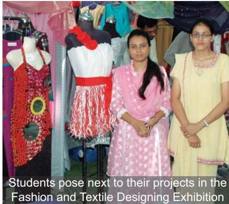
Students pose next to their projects in the Fashion and Textile Designing Exhibition

iACT regularly organizes exhibitions to display the work of its students. In this regard, the third Fashion and Textile Designing Exhibition was held at iACT. 79 students of Cohort IV displayed their final projects and course portfolios to over 200 visitors. The theme of the exhibition was 'Unique Dresses', chosen to challenge students' imagination and creativity and to facilitate them in thinking out of the box. Displayed items included a range of casual and formal wear, fashion accessories, printed unisex dresses and bed sheets using tie and dye, batik, fabric painting, screen printing and silk printing.