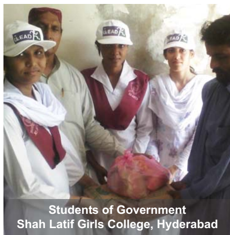
Students of Government Shah Latif Girls College, Hyderabad

These young leaders demonstrated impressive management skills, as they systematically organized, sorted, categorized, packed and transported the material collected. After Ramadan, more community service activities will be undertaken by iLEAD colleges and schools.