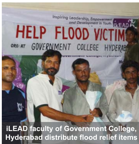
iLEAD faculty of Government College, Hyderabad distribute flood relief items