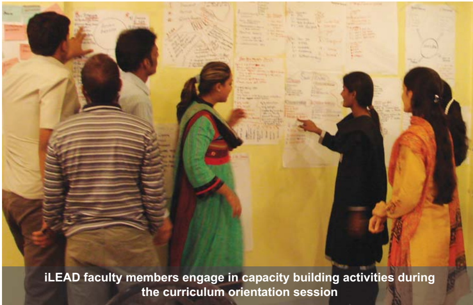
iLEAD faculty members engage in capacity building activities during the curriculum orientation session

An exciting deliverable of the iLEAD program is the development of the curriculum for nurturing healthy minds and bodies. In July 2010, the curriculum was introduced to the sports faculty members of partner colleges. The main purpose was to prepare teachers for piloting the curriculum in a real setting. Fifteen iLEAD sports faculty members participated in the curriculum orientation and