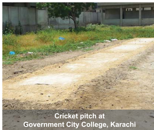
Cricket pitch at Government City College, Karachi