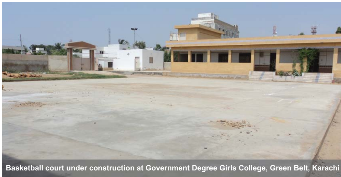
Basketball court under construction at Government Degree Girls College, Green Belt, Karachi

Availability of functional sports facilities plays an important role in encouraging students to participate in sports activities. In light of this fact, iLEAD is supporting its partner colleges to upgrade their existing sports facilities. iLEAD partner colleges embarked upon their refurbishment work in May 2010. The process was hampered due to prolonged