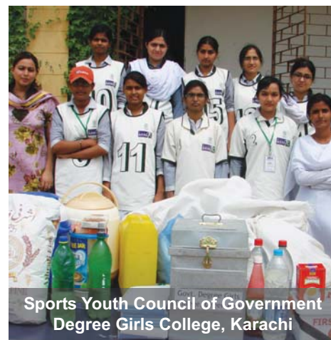
Sports Youth Council of Government Degree Girls College, Karachi