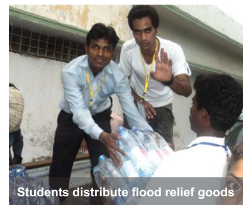
Students distribute flood relief goods

Through Social Action Projects (SAPs), students gain valuable community service experience. iACT students collected over 1,000 sets of clothing and edibles, which they distributed at a flood relief camp in Karachi. By partaking in this SAP, students learnt how to manage projects, share responsibility and exercise leadership skills. Future SAPs include designing a second relief project focused on procuring health items and a health camp; setting up an Adult Literacy Center; and organizing a mentorship program for the children of SoS Village.