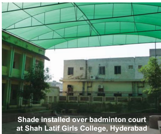
Shade installed over badminton court at Shah Latif Girls College, Hyderabad

rainfall and poor law and order situation in the city. The cricket pitch at Government City College Karachi and the badminton court at Shah Latif Girls College, being refurbished as a part of the iLEAD project, will soon be ready for student use. Government College Hyderabad has also begun working on the refurbishment of its basketball court.