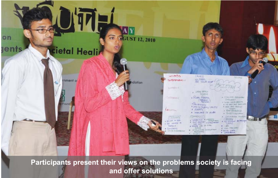
Participants present their views on the problems society is facing and offer solutions