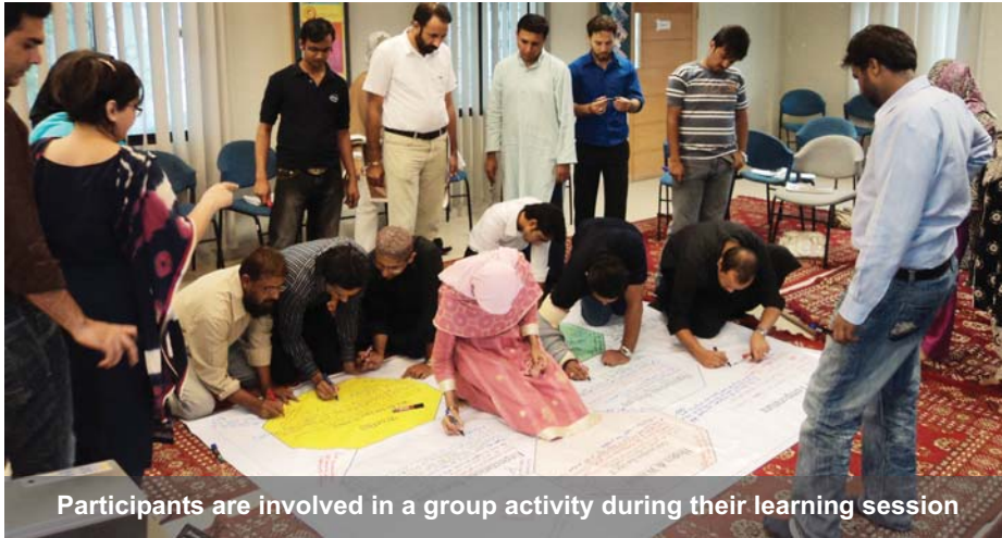
Participants are involved in a group activity during their learning session