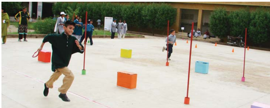
Government Degree Girls College holds athletics activities for partner schools

All partner colleges are working with their partner schools for promotion of sports. Interesting activities are being designed for children, some of which are as follows: