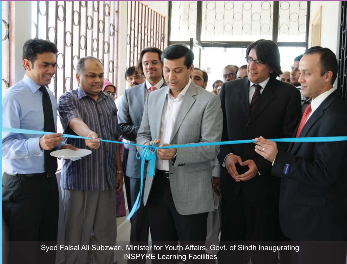
Syed Faisal Ali Subzwari, Minister for Youth Affairs, Govt. of Sindh inaugurating INSPYRE Learning Facilities

page 7 Sports Days Organized at iLEAD Partner Schools