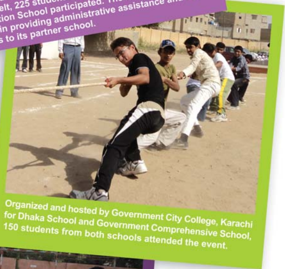
Organized and hosted by Government City College, Karachi for Dhaka School and Government Comprehensive School, 150 students from both schools attended the event.