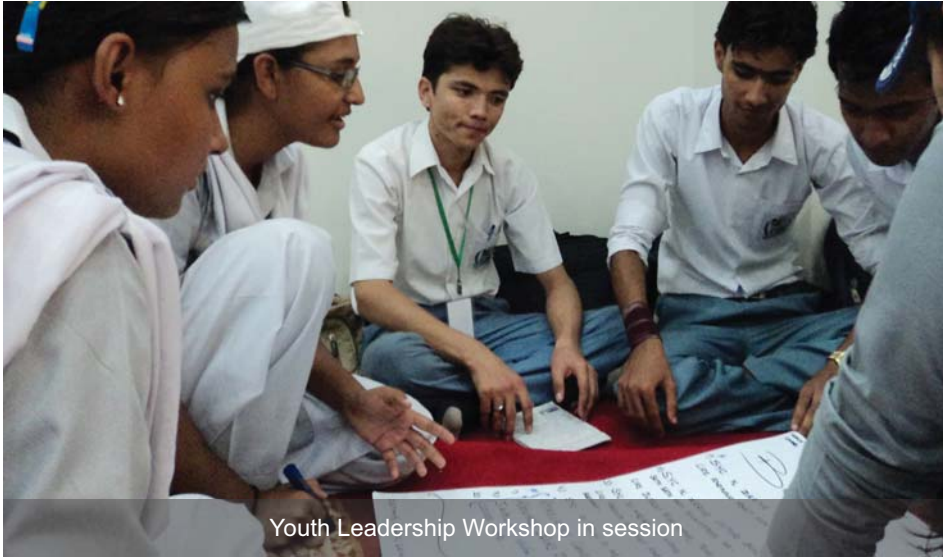
Youth Leadership Workshop in session

Nurturing leadership attributes of the youth is one important feature of iLEAD Program. Sports Youth Councils (SYCs) have been formed in all iLEAD partner colleges to create space for active youth leadership. Each SYC comprises of at least 10 students.