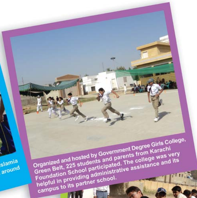
Organized and hosted by Government Degree Girls College, Green Belt, 225 students and parents from Karachi Foundation School participated. The college was very helpful in providing administrative assistance and its campus to its partner school.