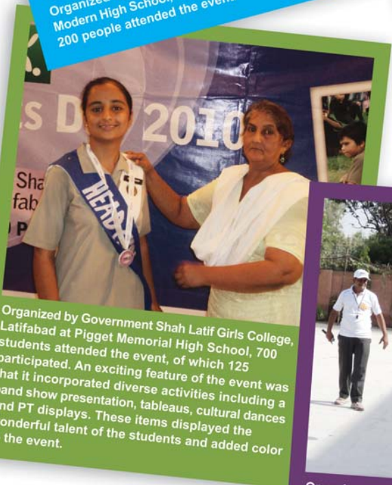
Organized by Government Shah Latif Girls College, Latifabad at Pigget Memorial High School, 700 students attended the event, of which 125 participated. An exciting feature of the event was that it incorporated diverse activities including a band show presentation, tableaus, cultural dances and PT displays. These items displayed the wonderful talent of the students and added color to the event.