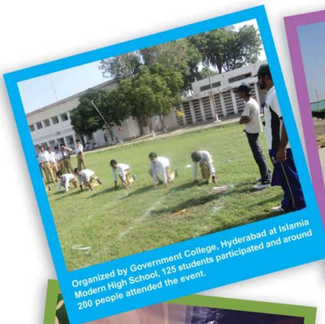
Organized by Government College, Hyderabad at Islamia Modern High School, 125 students participated and around 200 people attended the event.