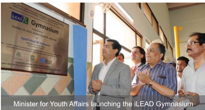
Minister for Youth Affairs launching the iLEAD Gymnasium