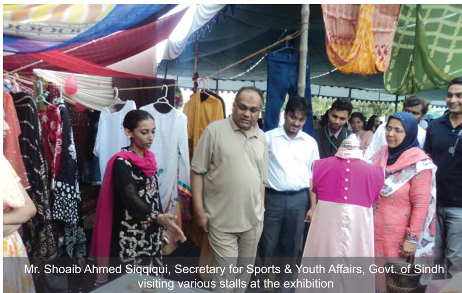
Mr. Shoaib Ahmed Siqqiqi, Secretary for Sports & Youth Affairs, Govt. of Sindh visiting various stalls at the exhibition

iACT organized its 2 nd Textile and Fashion Design Exhibition which displayed a variety of products of its students. More than 60 students displayed their work which included a range of dresses, dress accessories and material developed using fabric painting, silk screen printing, batik and tie and dye techniques. Students managed to sell and receive orders for a variety of their products during the exhibition.