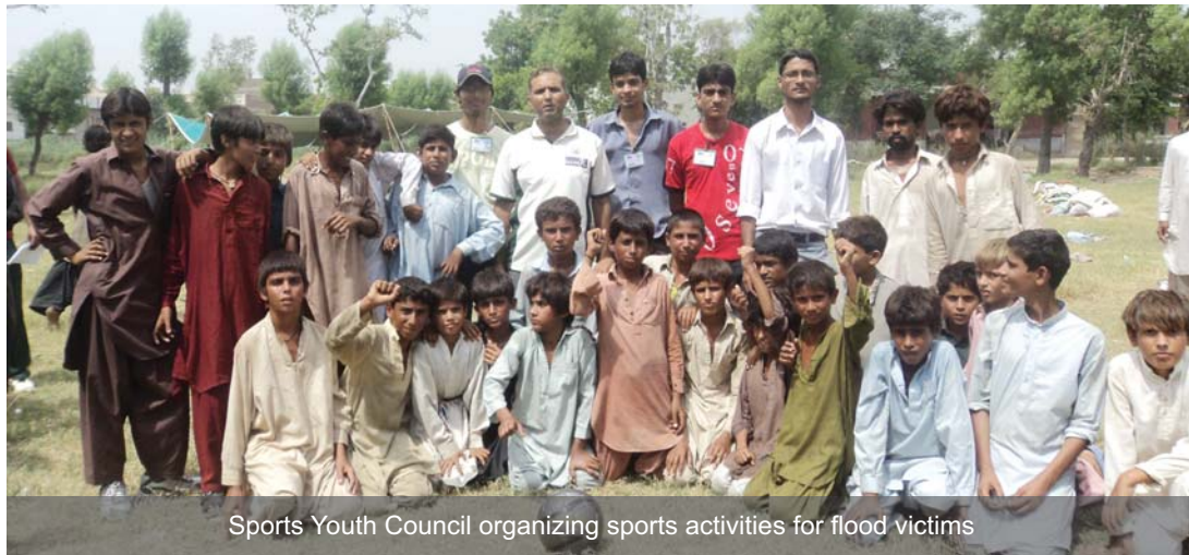
Sports Youth Council organizing sports activities for flood victims

These activities included soccer relay, cricket drills, sprint race, kids' athletics, football and volleyball matches. As a result of this experience, a healthier environment was created for camp residents, giving SYC the opportunity to plan and lead similar community events.