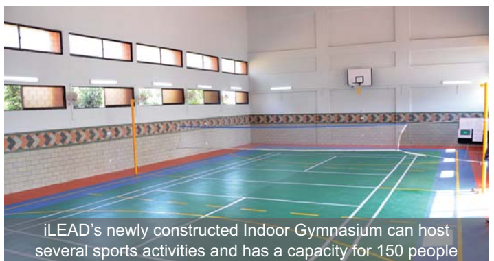
iLEAD's newly constructed Indoor Gymnasium can host several sports activities and has a capacity for 150 people