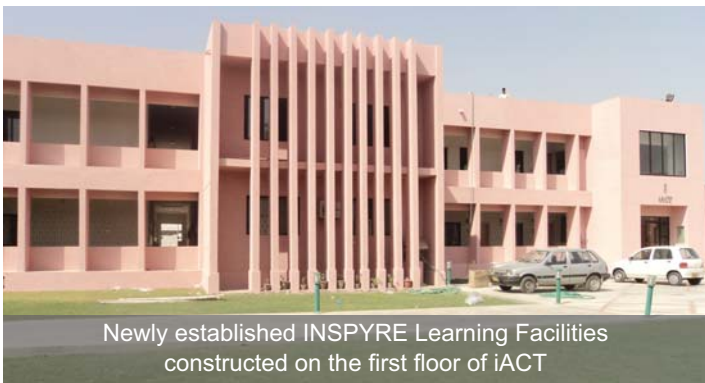
Newly established INSPYRE Learning Facilities constructed on the first floor of iACT